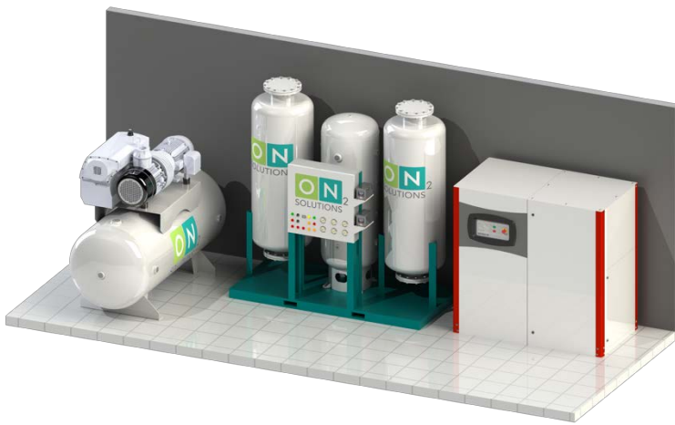
OC-130 System in a room and ROCS, excluding Distribution Panel, secondary and reserve cylinders

The ON 2 Oxygen Concentrator is specifically engineered for medical oxygen gas generation. The OC-130 is designed to produce 515 litres/min of 95% oxygen (+/-1%) at 85 PSI delivery pressure. Oxygen Concentrators offer unmatched reliability and operating efficiency and are custom designed to provide an immediate reduction in cost and eliminate exposure to future increases due to increased usage or supplier price hikes. ON 2 Oxygen Concentrator systems are designed to be in compliance with the National Standard CAN/CSA-Z10083-08 and International Standard ISO 10083 for Oxygen Concentrator supply systems for use with medical gas pipeline systems.